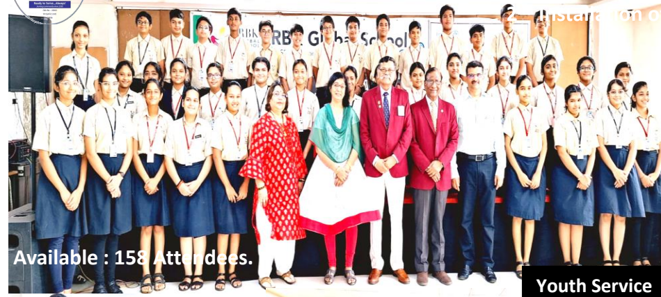
Available : 158 Attendees.