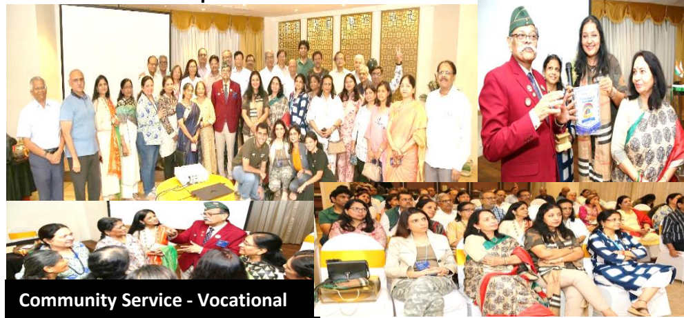
Community Service - Vocational