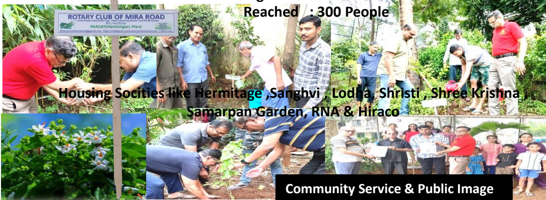
Housing Societies like Hermitage , Sanghvi , Lodha, Shristi , Shree Krishna , Samarpan Garden, RNA & Hiraco