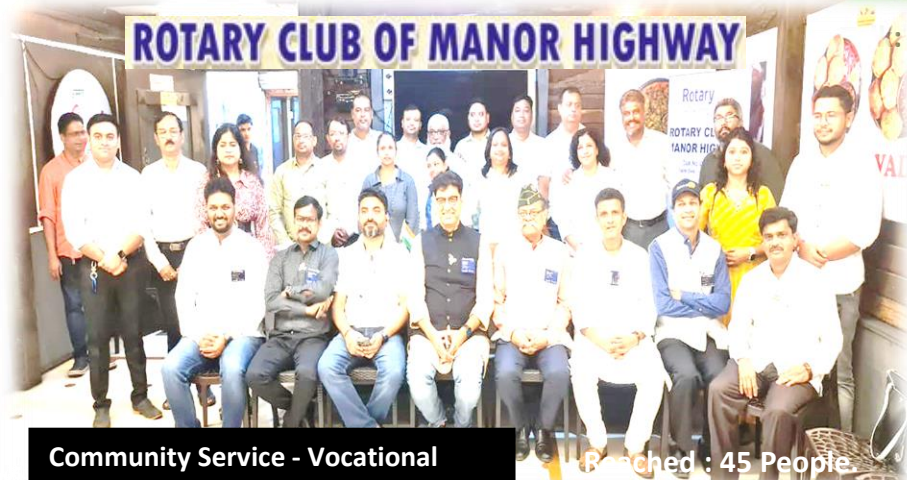
ROTARY CLUB OF MANOR HIGHWAY