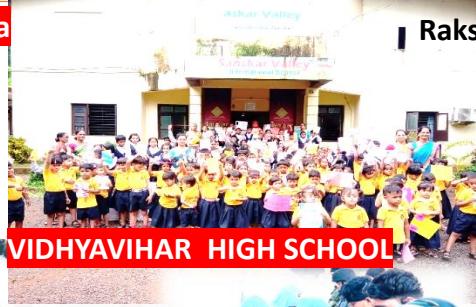
VIDHYAVIHAR HIGH SCHOOL