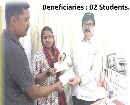
Community Service - Education