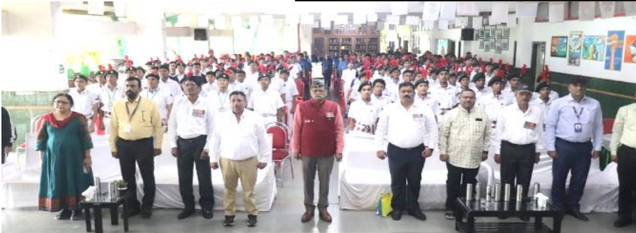
Community Service - Vocational