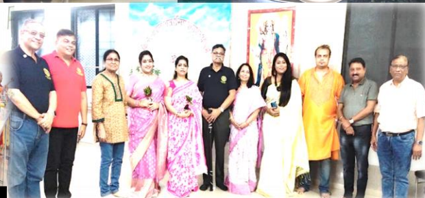
Available were : 125 People.