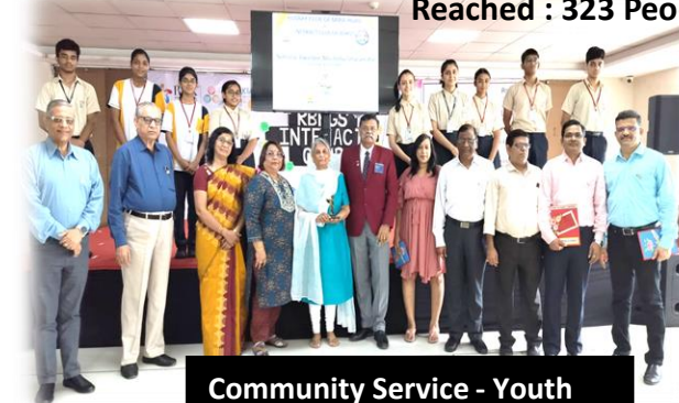
Community Service - Youth