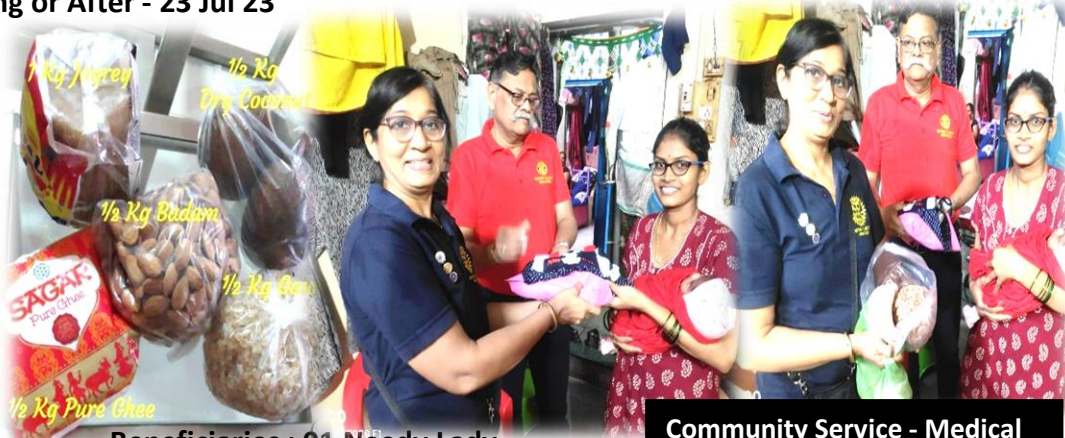
Beneficiaries : 01 Needy Lady.