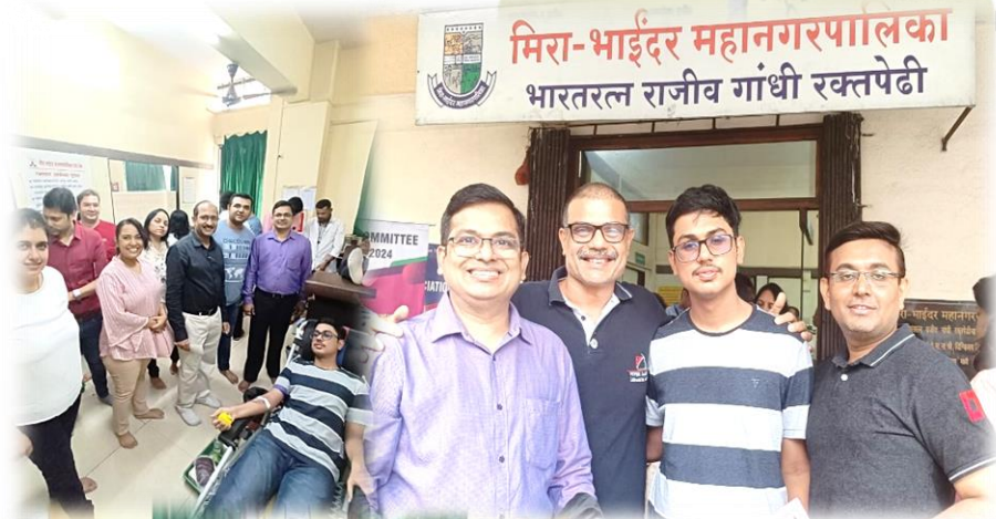
Available were : 53 Donors.