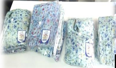
Community Service & Public Image