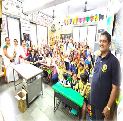
Community Service- Vocational