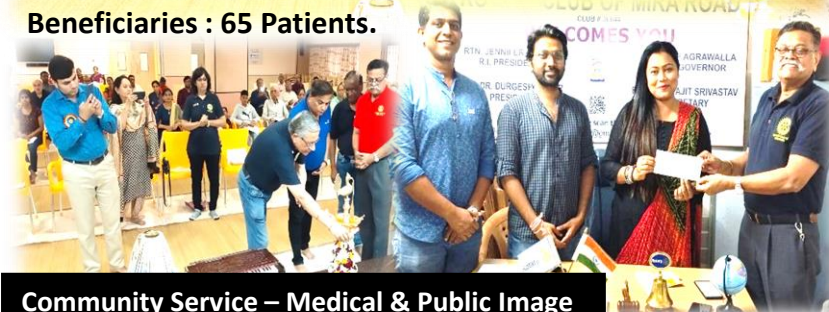
Community Service – Medical & Public Image