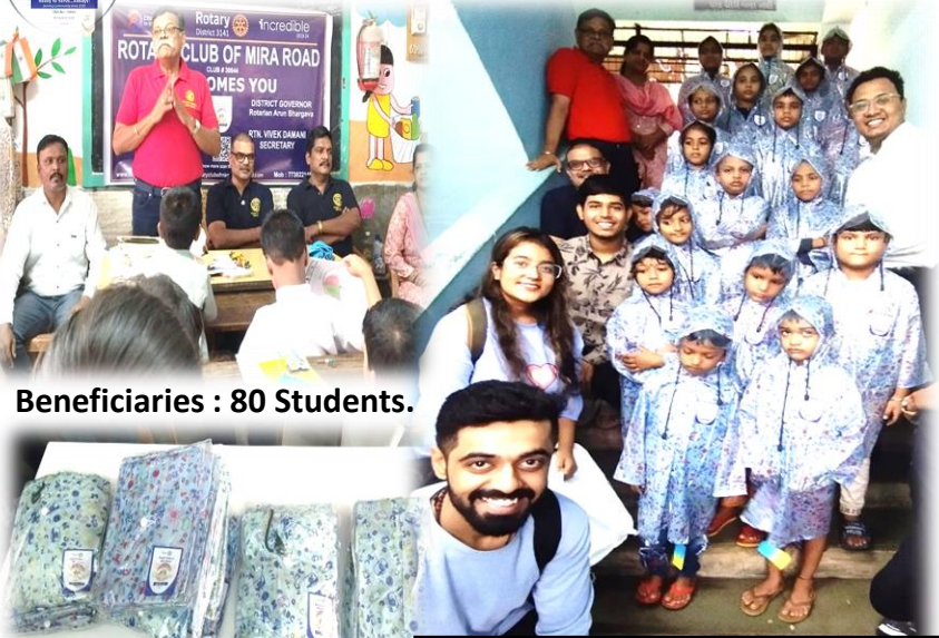
Beneficiaries : 80 Students.