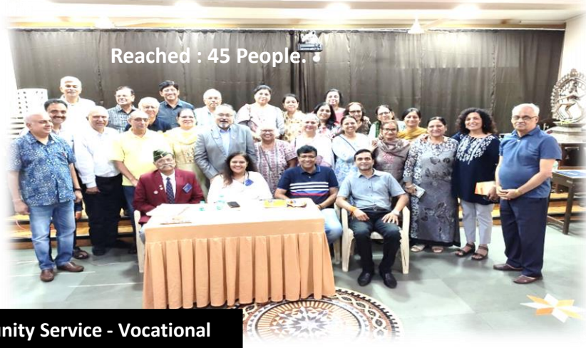
Community Service - Vocational